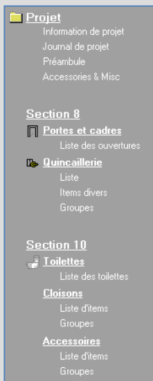
The Project Binder

AVAcad , our unique vertical market CAD product and part of the AVaproject package, is a complete drawing program for the creation of custom sidelite elevations. Elevations created in AVAcad can be seamlessly integrated into AVaproject , allowing the most complex frame configurations to be scheduled, detailed and listed.